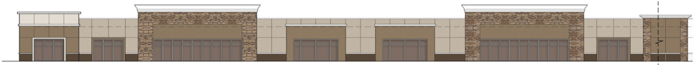
1 SOUTH ELEVATION- FRONT SCALE: 1/8" = 1'-0"