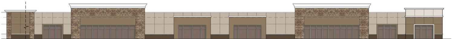
3 SOUTH ELEVATION- FRONT SCALE: 1/8" = 1'-0"