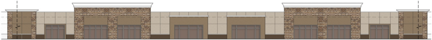
2 SOUTH ELEVATION- FRONT SCALE: 1/8" = 1'-0"