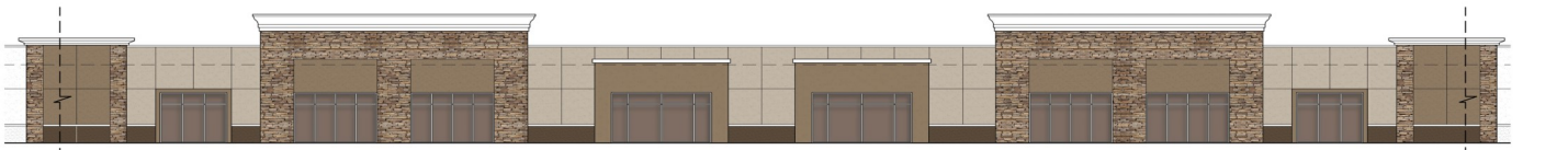
2 SOUTH ELEVATION- FRONT SCALE: 1/8" = 1'-0"