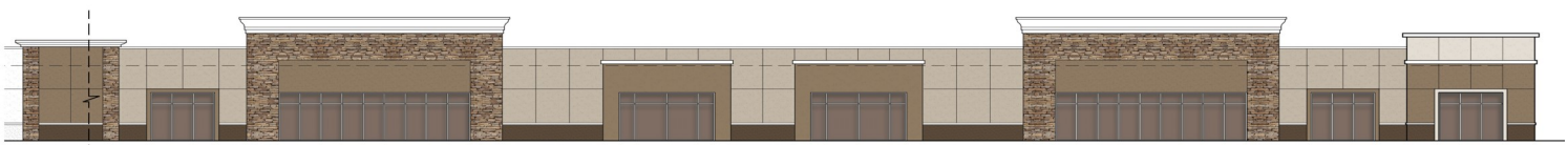
3 SOUTH ELEVATION- FRONT SCALE: 1/8" = 1'-0"